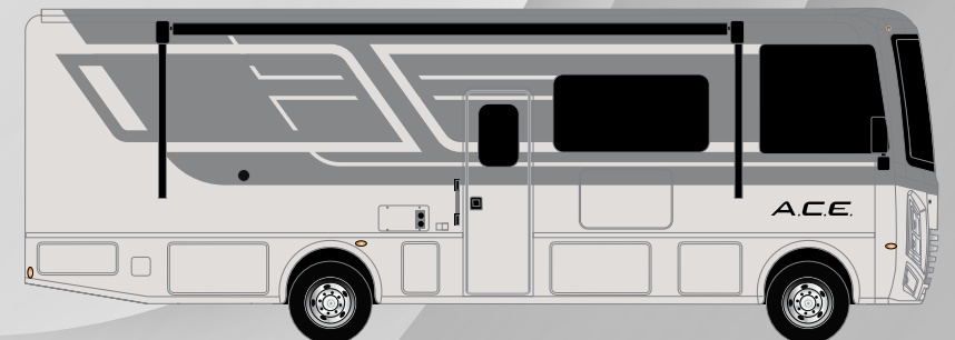
PARTIAL PAINT STRATUS EDITION